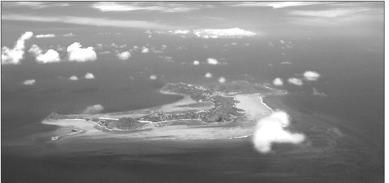
An aerial view of Canouan Island

In the Caribbean, Raffles Resort Canouan Island, The Grenadines was named St Vincent & the Grenadines' Leading Spa