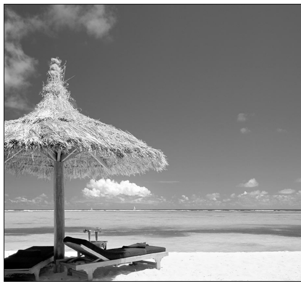
Your own private beach in paradise found

Resort. Comprising 156 luxury villas set on 300 acres of a 1200-acre private estate, the Raffles resort features breathtaking views, secluded white sand beaches, and the finest cuisine. Its RafflesAmrita spa, built amongst the natural, pristine settings along the hillside of the resort offers panoramic views of the sea along with the much lauded therapies of RafflesAmrita Spa