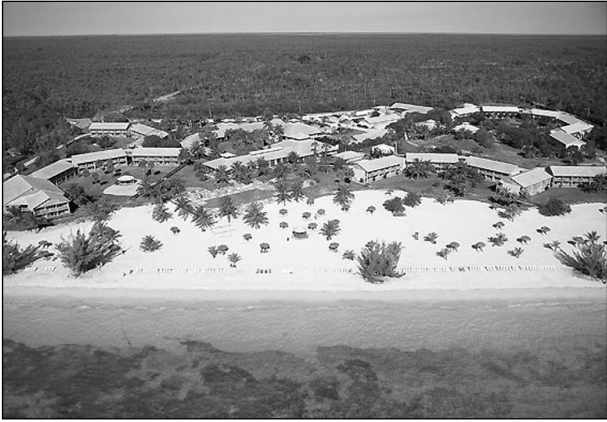
Aerial view of Viva Fortuna Beach, Grand Bahama Island