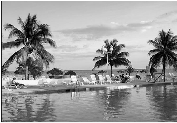
The Main Pool, Viva Fortuna Beach