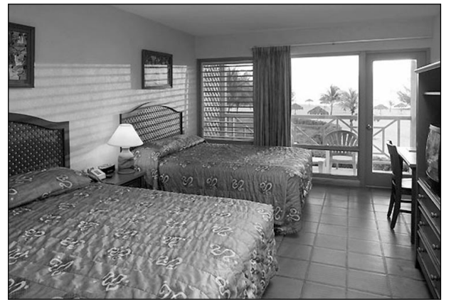
A Room with a View, Viva Fortuna Beach