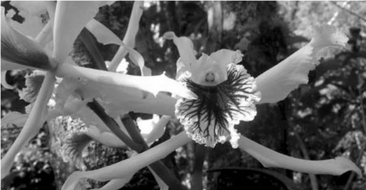
Flora Laelia crispa - RJ

Tiradentes was born in 1746 in what was then called São José del Rei (not to be confused by São João del Rei), one of the richest gold mining regions of Minas Gerais. He was orphaned at the age of 11 and raised by a surgeon. Never part of the local aristocracy, he was a jack of all trades: a second lieutenant in the local militia, a miner, traveling