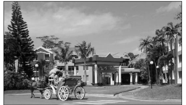
Playa Dorado Hotel, your carriage awaits!