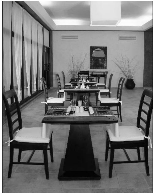
The elegant Bambu Restaurant