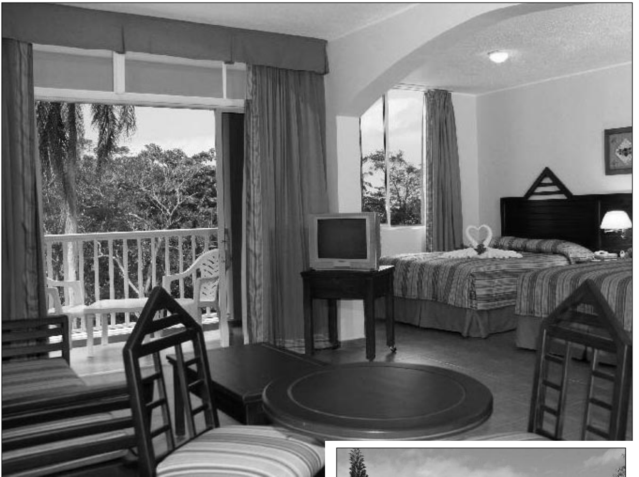
A Jr. Suite at Playa Dorado